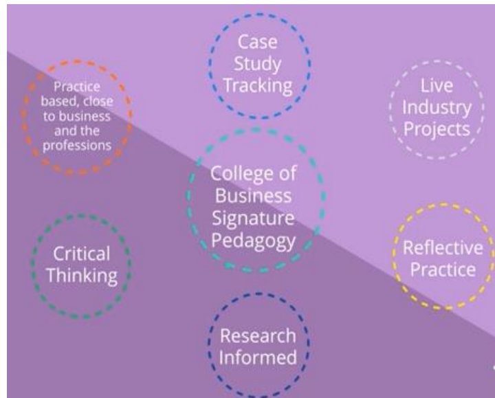
Figure 1: Business Disciplines Signature Pedagogy